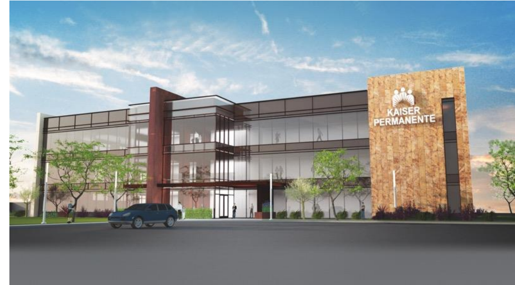
Porter Ranch Medical Offices (rendering)