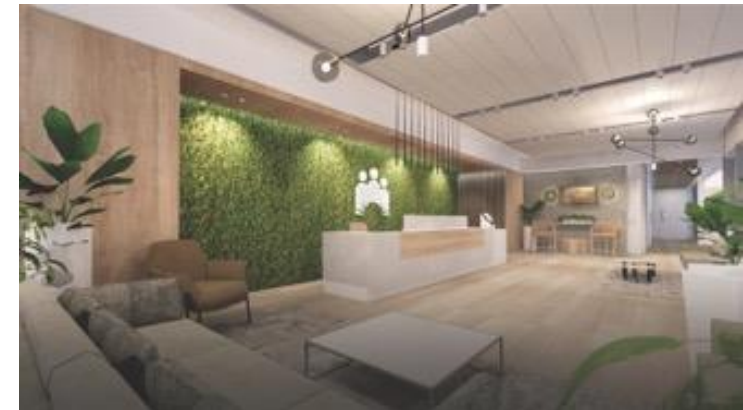
Care Essentials in downtown San Francisco