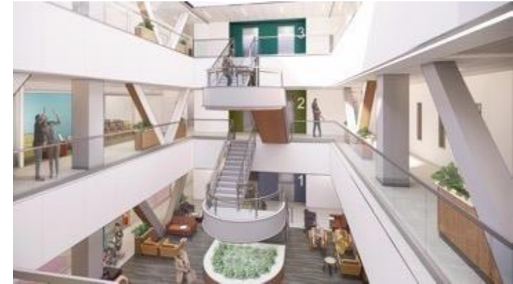
San Rafael Park Medical Offices (rendering)